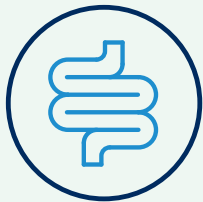
Gut Health and Microbiome